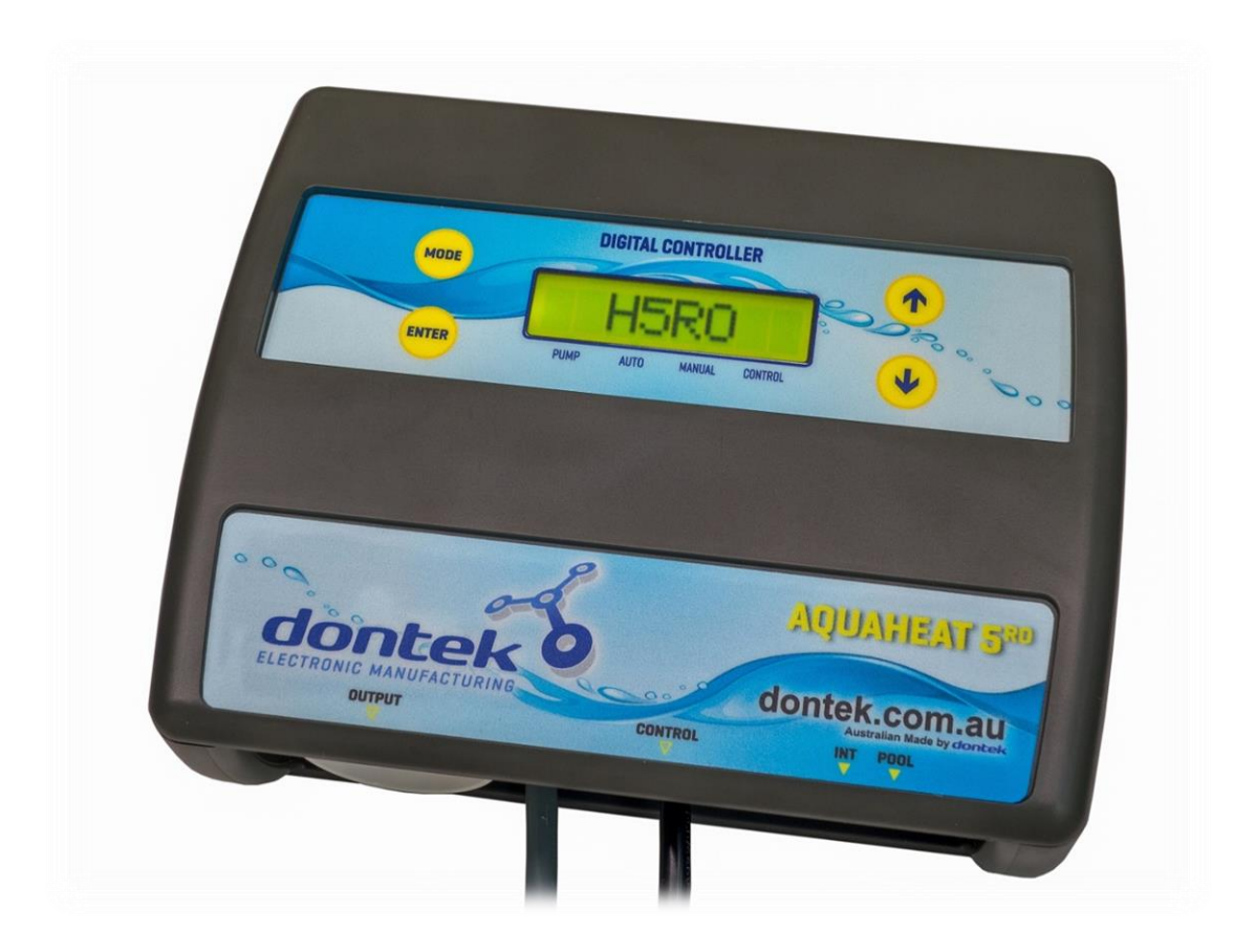
For illustration purposes only, alternative model shown.